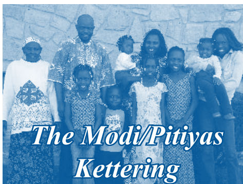
The Modi/Pitiyas Kettering

for her wheelchair to turn fully and the bathroom was not handicap-accessible. Their new home is completely wheelchair accessible with three foot doors in all rooms as well as a kitchen built to accommodate Paula's needs, giving her much more independence. It also features a wider garage built for wheelchair-accessible van access.