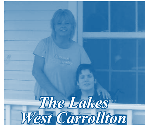
The Lakes West Carrollton