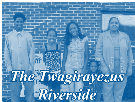
The Twagirayezus Riverside